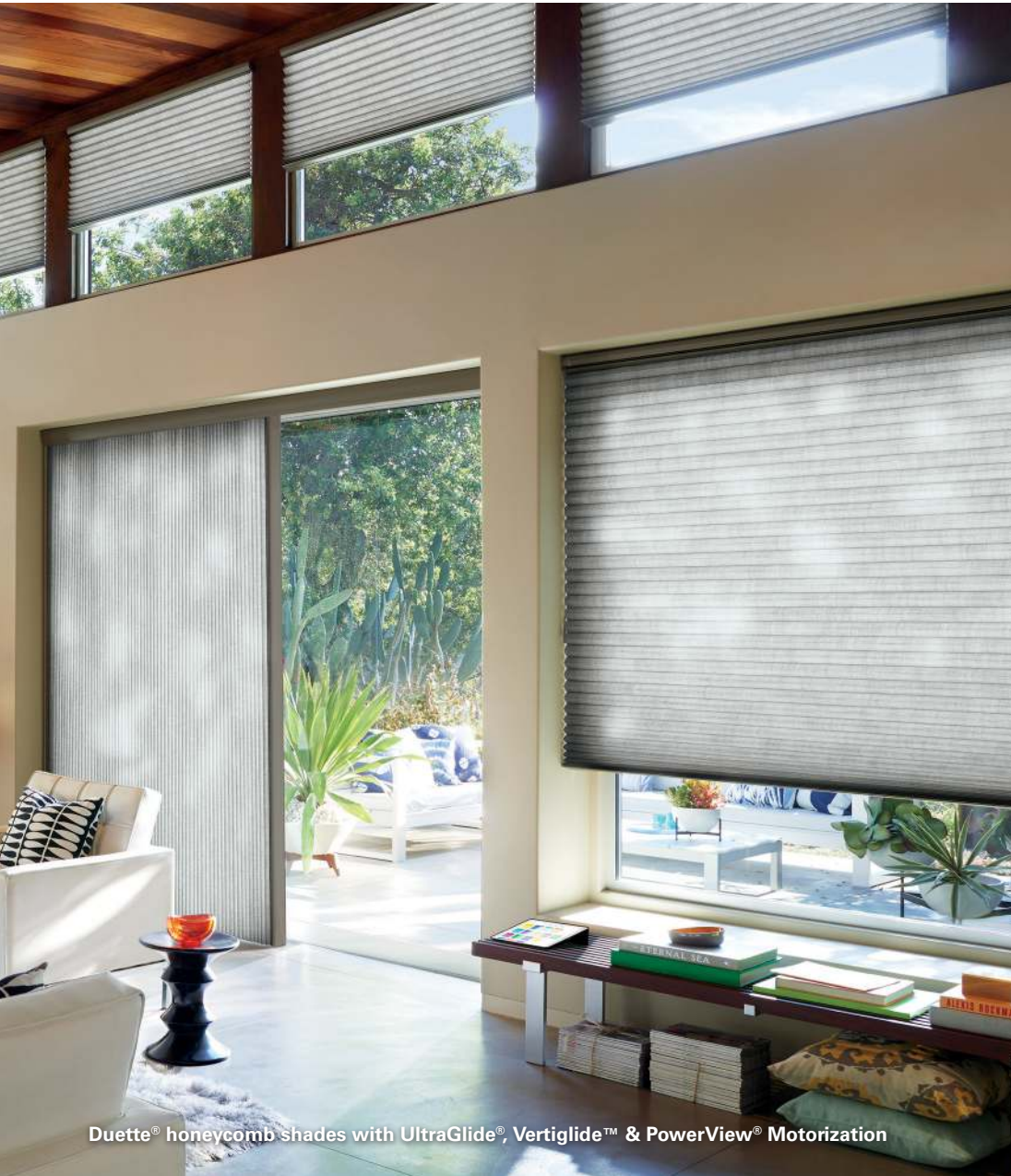
Duette® honeycomb shades with UltraGlide®, Vertiglide™ & PowerView® Motorization