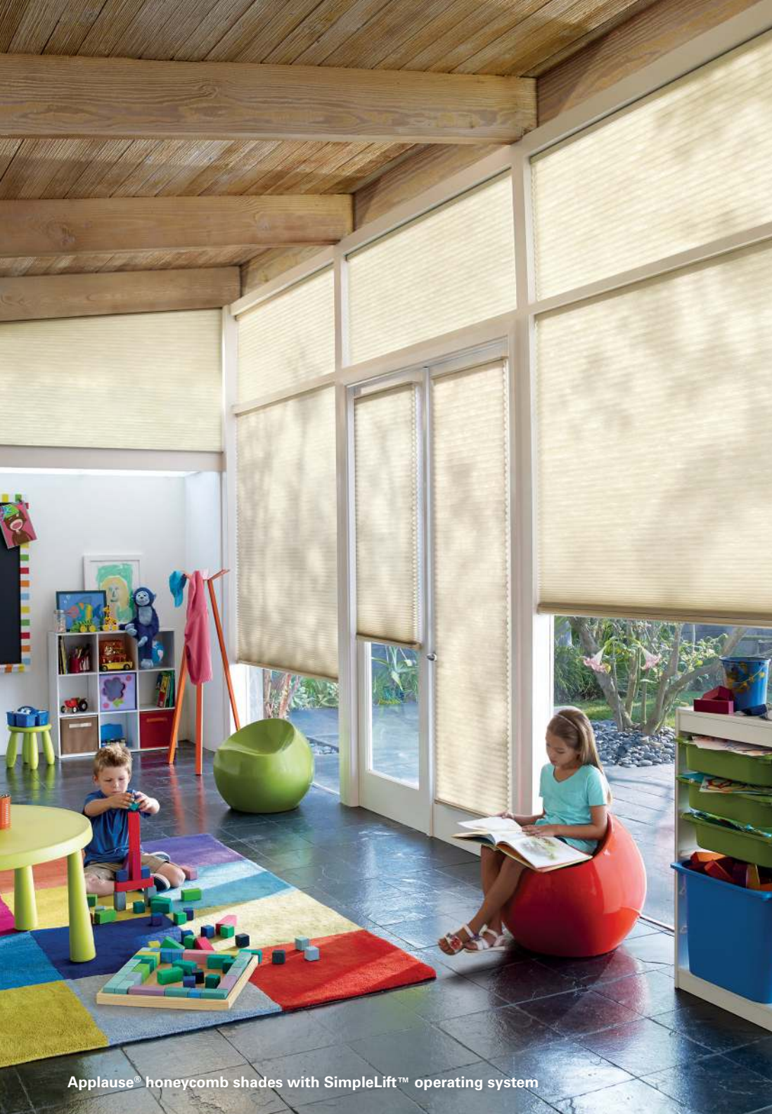
Applause® honeycomb shades with SimpleLift™ operating system