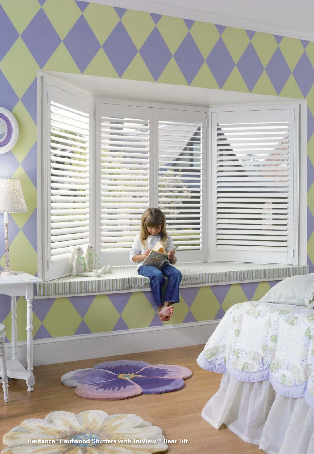
Heritage® Hardwood Shutters with TruView™ Rear Tilt