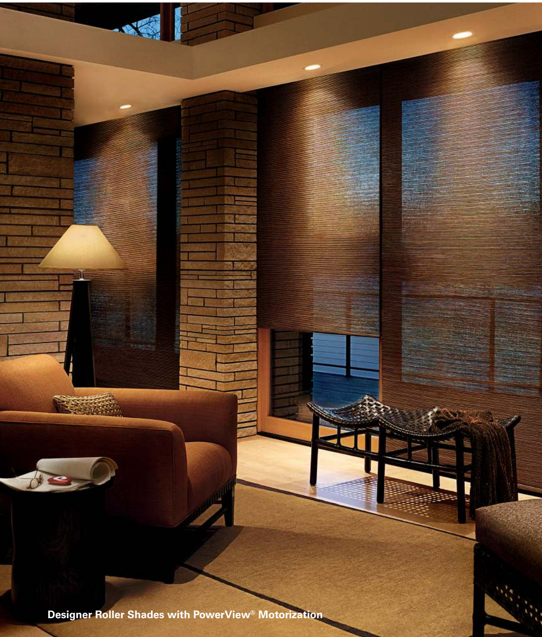
Designer Roller Shades with PowerView® Motorization