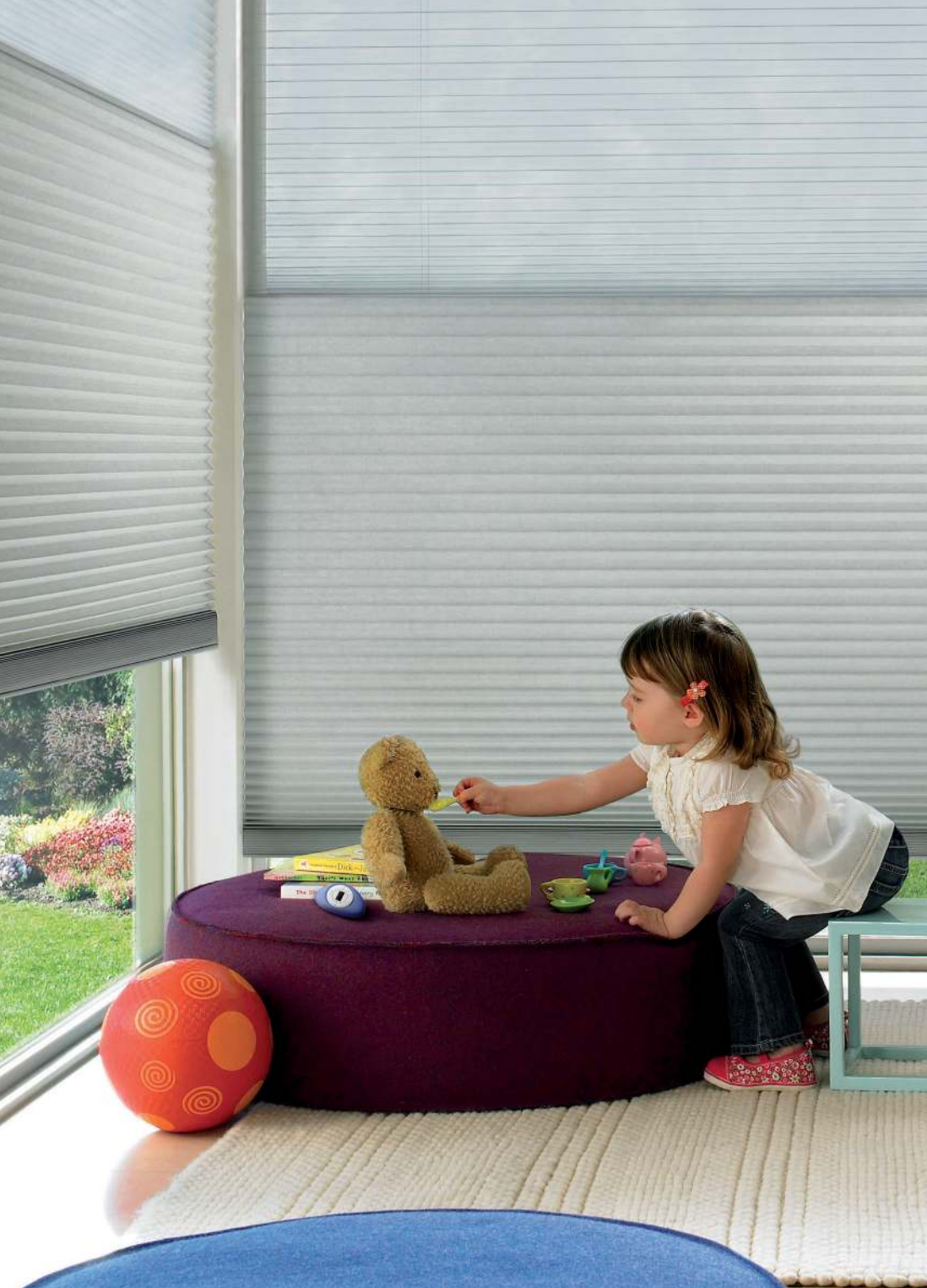
Duette® honeycomb shades with PowerView® Motorization